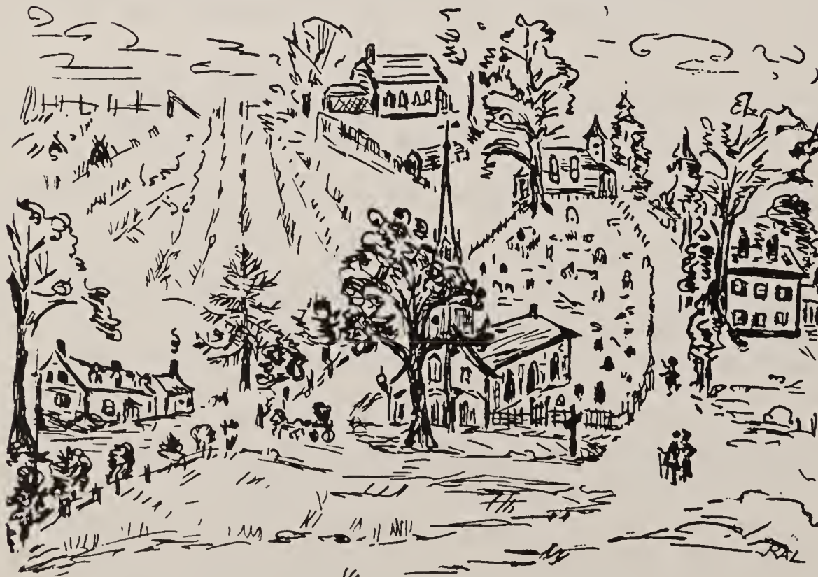
Paramus Church, 19th Century Ackerman-Bogert house on left. Parsonage on right, Revolutionary graveyard between Church and Chapel. Horse sheds and schoolhouse rear center.